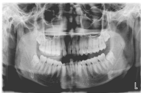
Figure 2: Panoramic radiograph shows hypodontia of maxillary right lateral incisor, microdontia of maxillary left lateral incisor and taurodontism of maxillary and mandibular second molars

The panoramic radiographs were also assessed for hypodontia. A tooth was diagnosed as congenitally missing when it could not be discerned radiographically on the basis of calcification and there was no evidence or history of extraction (Figure 2).