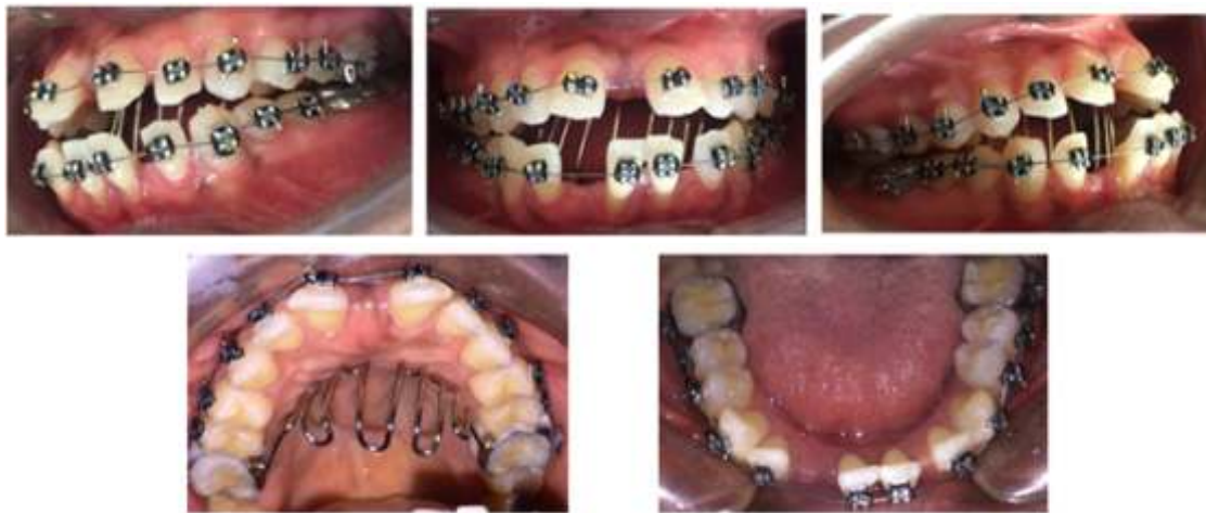
Figure 6a: Treatment progress photographs. Set-up