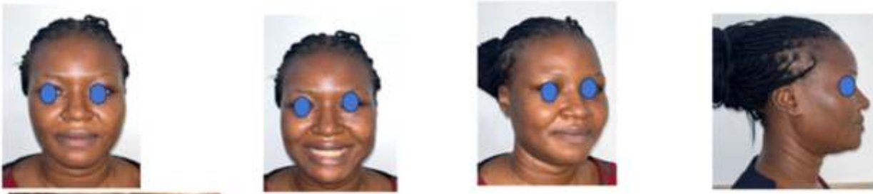
Figure 7: Posttreatment Extraoral photographs