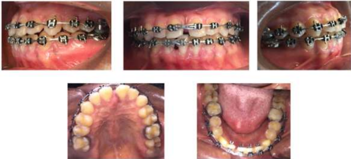
Figure 6c: Treatment progress photographs. Space closure using power-chains