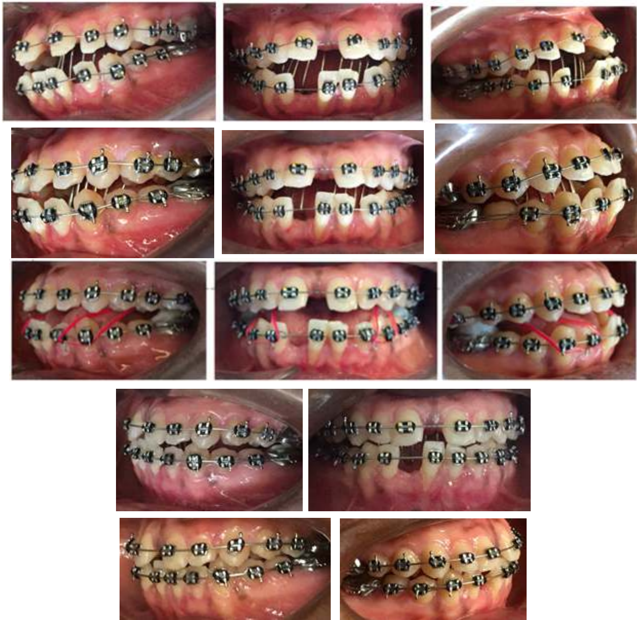
Figure 6d: Treatment progress snap-shorts photographs.