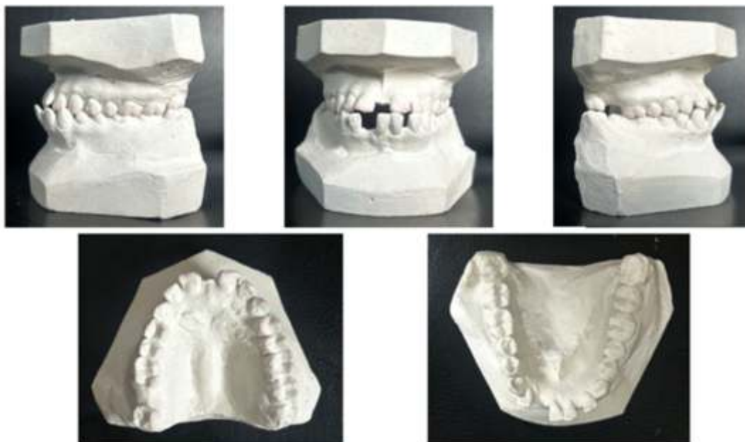
Figure 3: Pretreatment study models