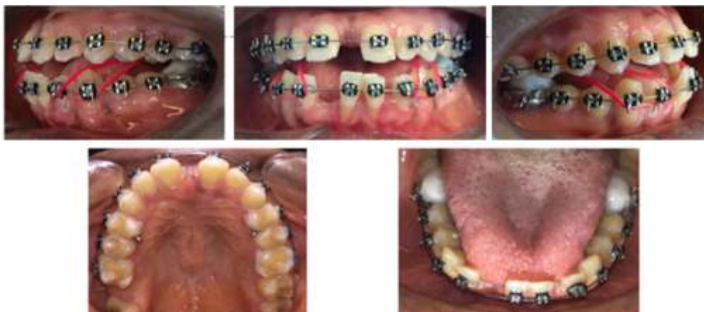
Figure 6b: Treatment progress photographs. Use of Class III-Cross-Elastic (inter-arch) method.