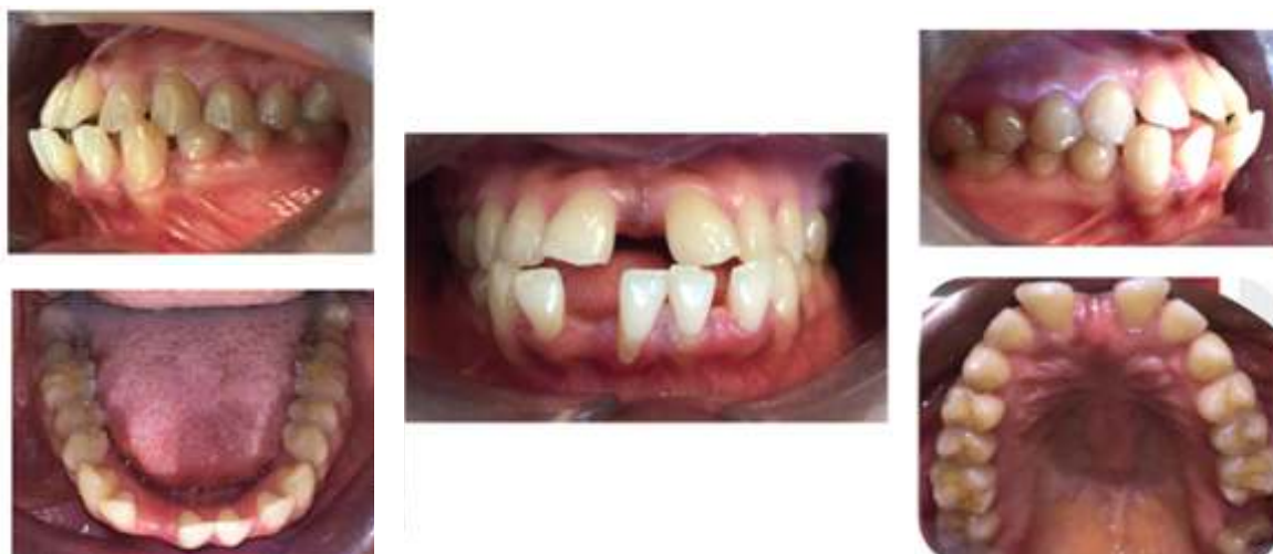
Figure 2: Pretreatment intraoral photographs