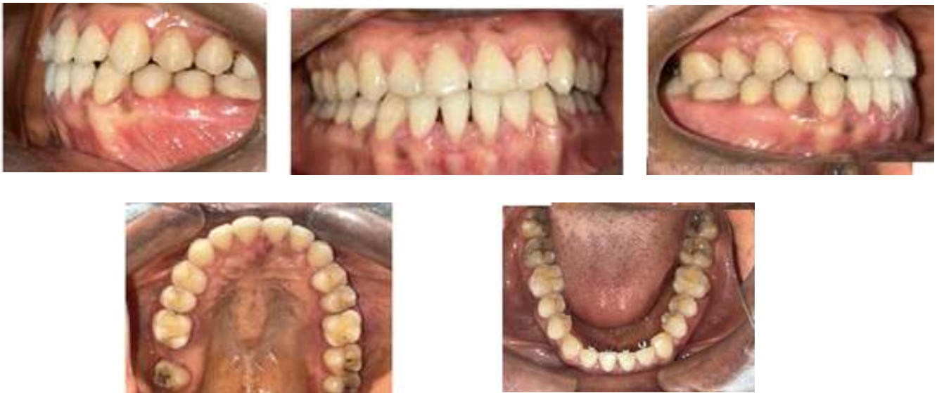
Figure 8: Posttreatment Intraoral photographs