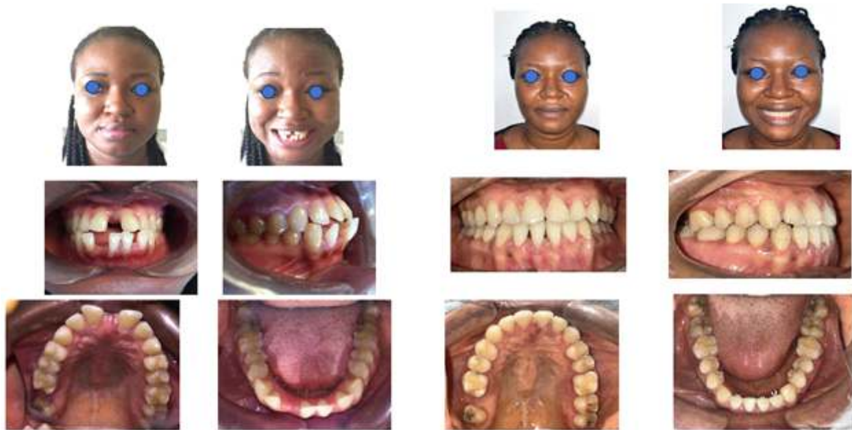
Figure 13: Treatment outcome comparison