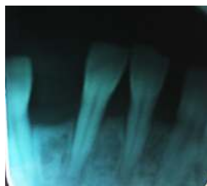
Figure 4: Pretreatment dental panoramic and periapical radiographs