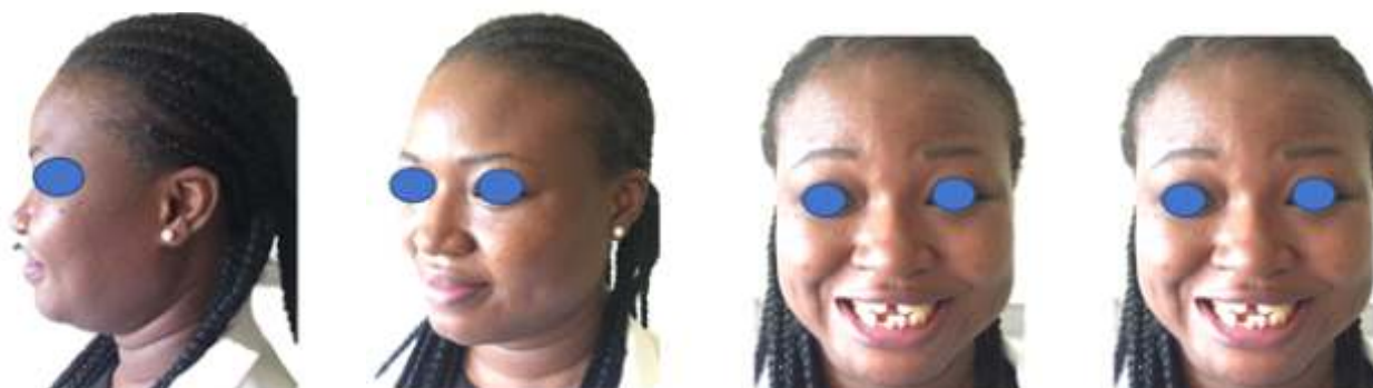
Figure 1: Pretreatment Extraoral photographs

A multidisciplinary assessment by the Orthodontists, Periodontist, Endodontist and Conservative dentists made a diagnosis of Angle's class III subdivision left malocclusion on skeletal pattern 3 complicated by reverse overjet of (-) 5mm, crossbite of 11, 12, 13, 21, 22 and 23, severe lower anterior spacing of 11 mm, severe upper anterior spacing of 9 mm with mid line diastema of 6mm, mild lower posterior spacing of 1 mm on the right and left, expanded anterior segment of the lower arch, anterior resting position of the tongue and a tongue sucking habit, rotations of teeth 11, 13, 21, 32, 41 and 42, distal tilting 11, 12, 21, 22, 41 and 42, potentially competent lips of 3/0, non-coincident dental midlines with lower deviated 3mm to the left, lisping speech, dental caries of 38, 47 and 48, Ellis class I trauma involving teeth 11, 12, 21, 22, 31 and 32, gingival recession of 31, 41 and 42, Grade I mobility of 31 and 41