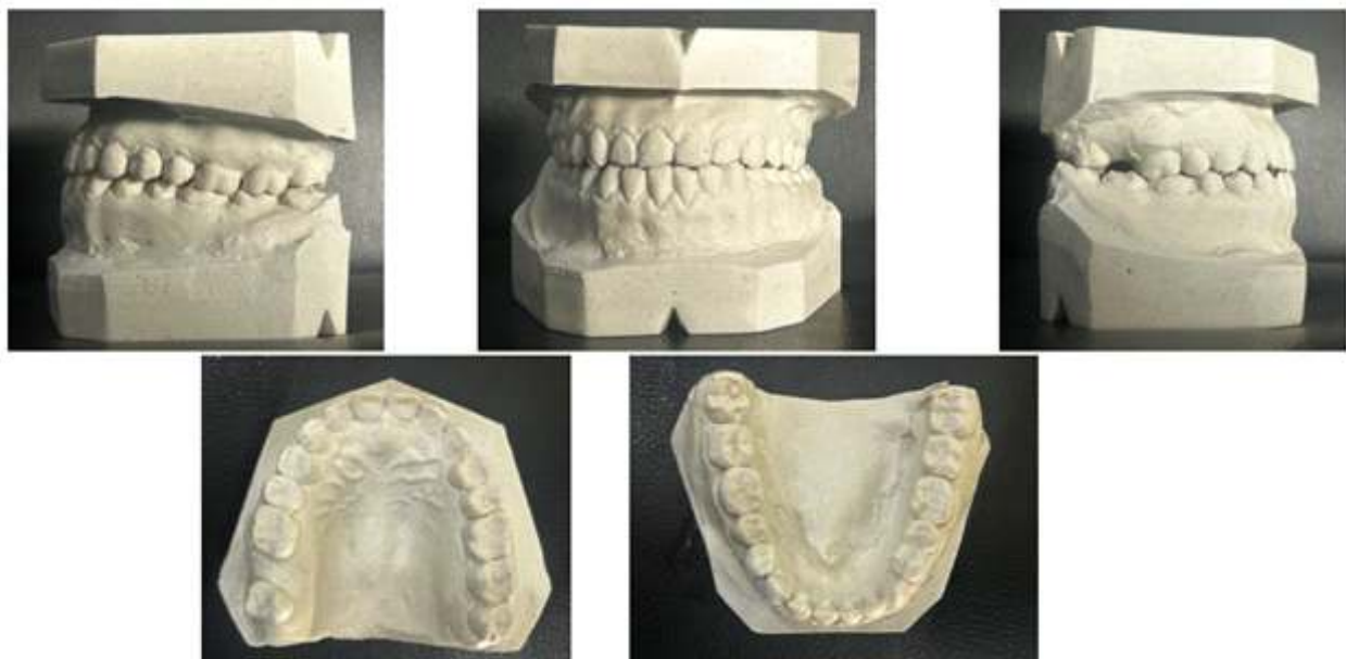
Figure 9: Posttreatment study models